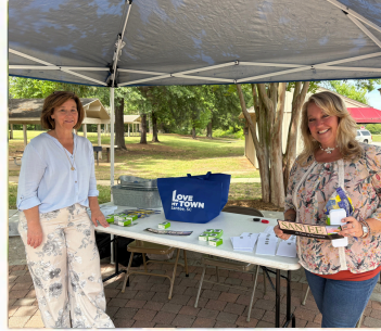
Home Sweet Santee, Together We Love Santee