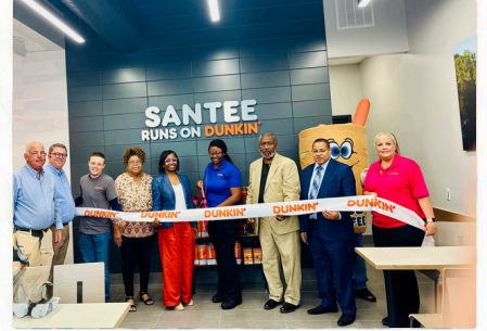
Town of Santee Welcomes Growth; Celebrating Dunkin' Donuts