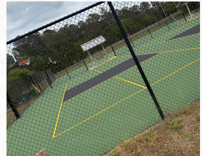
Investing In Our Parks & Recreation - Pickleball Courts Ready