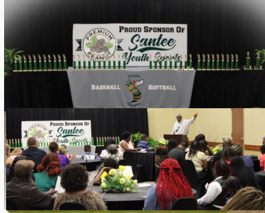
Congratulations to the Santee Stingers on a great season! More photos featured in our next newsletter edition!