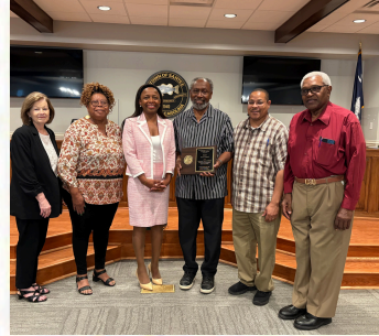
Municipal Leadership Achievement Council Earns Honor Roll