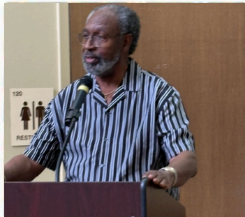
Building a Stronger Community; Mayor Hilliard in Session